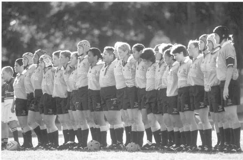
The Vodafone Wallaroos line up before their Test Match against England in Sydney last year.

Test Points: 15 - [3 tries] Test Debut: 1994 v New Zealand Nickname: Sal Occupation: Student