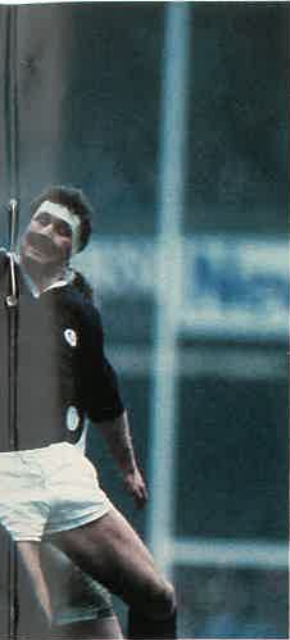
Scotland 1987 ON jumping at the Line-out