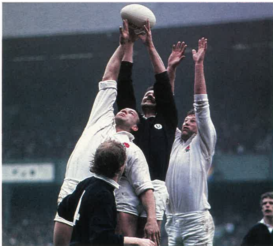
England v. Scotland 1987