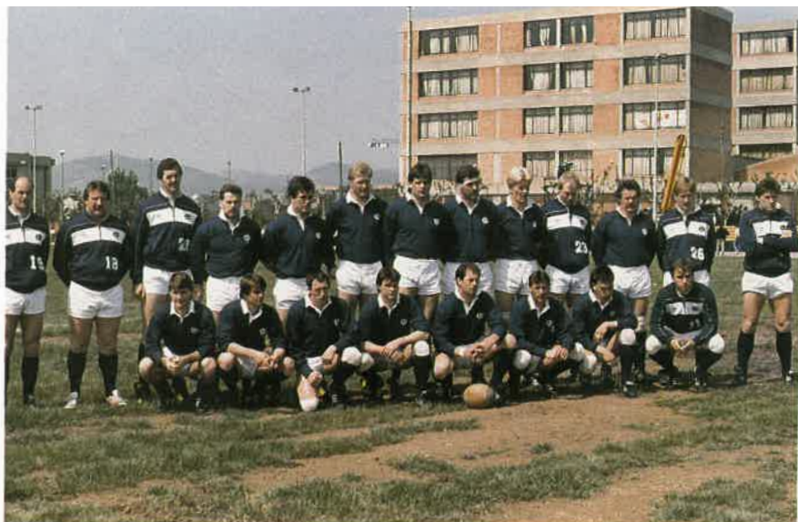
Scotland Squad in Cornella, Spain May 1986.

the Triple Crown. The favourites hat is one which Scotland do not wear well. It was sitting that bit less easy as the visitors had lost both their first choice centres and found a new pair not to everyone's liking.